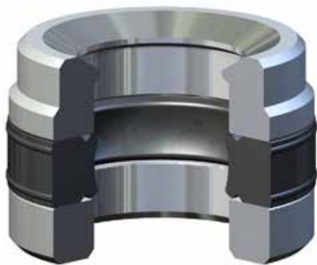
11" RCS SECONDARY PACKOFF

The "RCS" Secondary Packoff is available in most casing sizes, supporting equipment offering sizes of 9", 11", and 13 5/8", with pressure ranges from 2000 PSI to 10 000 PSI